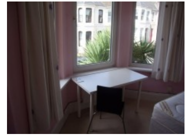
4 Greenbank Avenue Total floor area 170.0 sq. m. (1,830 sq. ft.) approx