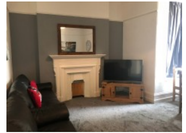
32 Queens Road

Total floor area 262.0 sq. m. (2,712 sq. ft.) approx